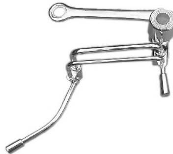
Step 5: Secure locking ring back in its initial position.