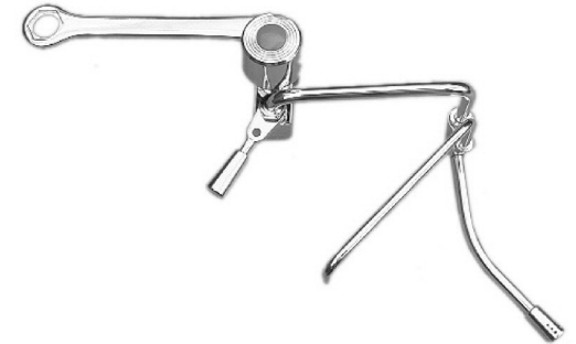
Step 3: Release guide rod.