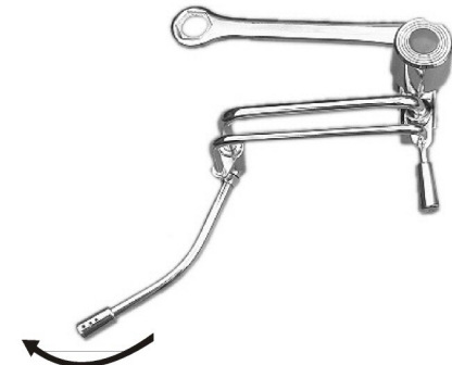
Step 6: Loosen shower arm lock nut. Then rotate shower arm and spout. Finally, secure lock nut.