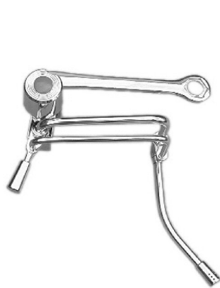
Step 1: Place your Bidematic in initial position as shown above.